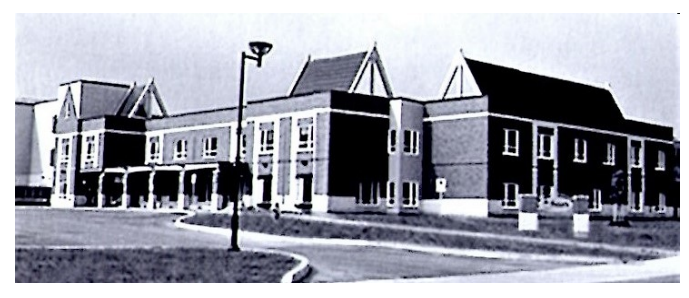
St. Peter's Residence for long-term care sits on former sanatorium land donated by Chedoke Health Corporation.

On the other hand we can take satisfaction from the fact that based on a 2006 Hamilton Health Science's Development Plan, almost half of the former Chedoke property has been designated to facilitate innovative educational programs, research, care and accommodation for the elderly as well as community recreational services. Adapting to the community's needs from the very beginning has been the Chedoke Legacy.